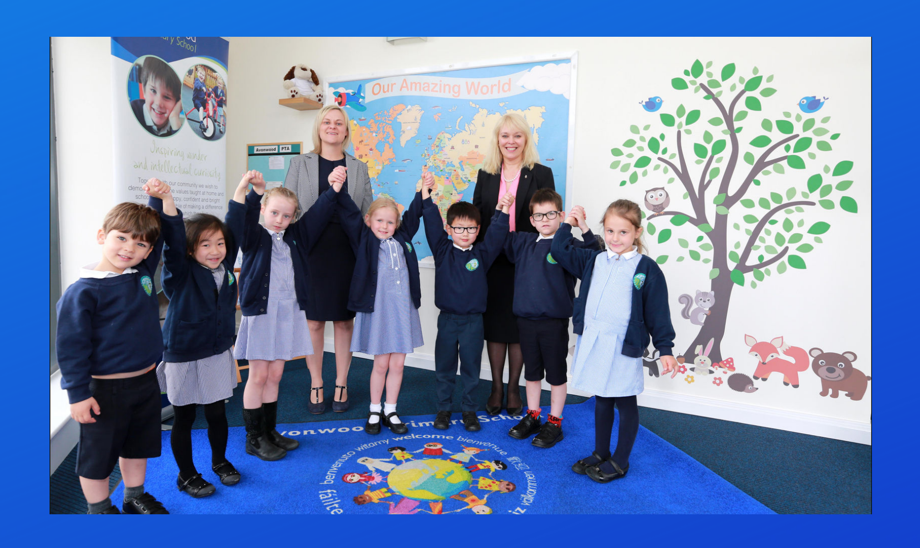
Read more about Avonwood here Watch here a video of Avonwood Primary School